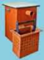
GREASE TRAP TYPE 'A'