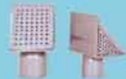
CORNER ROOF OUTLETS