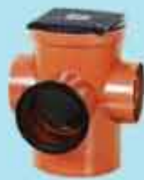
SEALED GULLY TRAPS