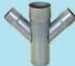
REDUCER 'Y' BRANCHS