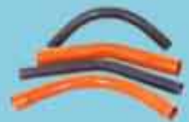
LONG RADIIUS BENDS