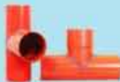
SEPTIC TANK TEES