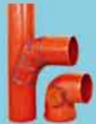
SWEEP TEE AND ELBOWS