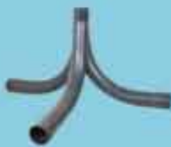
STREET LIGHTING CONDUIT BENDS