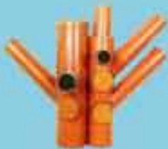
DRY MAN HOLES