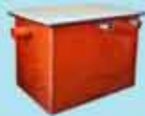
GREASE TRAP TYPE 'B'